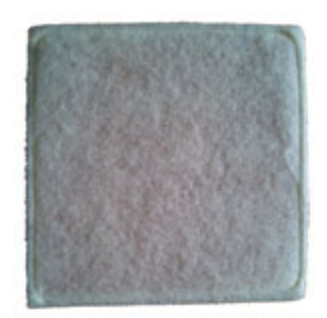
NaturalSorb/Safety Shield Filter

The company responsible for introducing this technology is Kiwi Bond International, Inc., and the filters are marketed with the name "NaturalSorb." It is the original patented natural-wool filter of this type for commercial-kitchen ventilation systems. The filters are comprised of sheep's wool — wool fibers are a